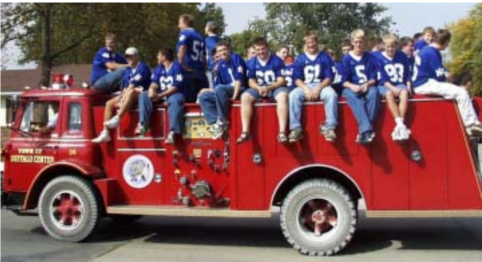
FOOTBALL PLAYERS RIDE ON THE BC FIRETRUCK