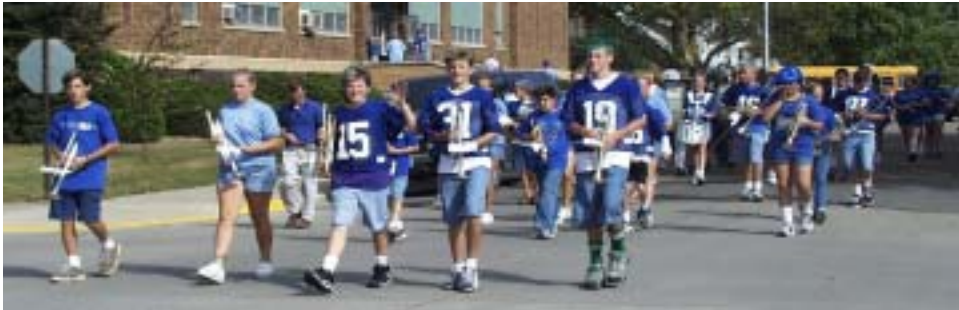
THE NIMS MARCHING BAND