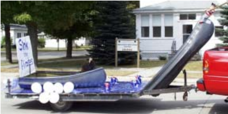
FIRST PLACE FLOAT - "SINK THE PIRATES" BY JUNIOR CLASS