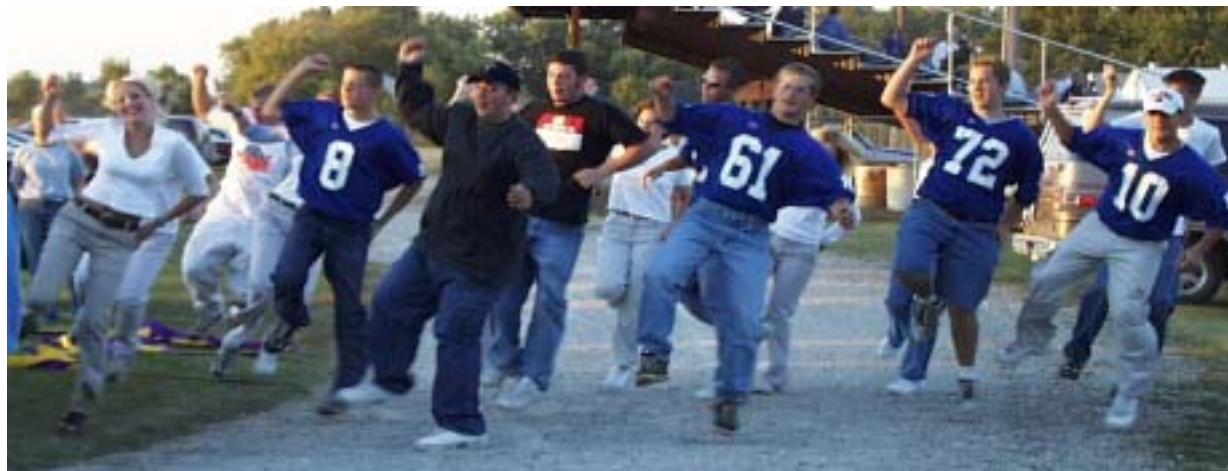
FUN NIGHT—THIS IS WHAT HAPPENS WHEN A BUNCH OF FOOTBALL PLAYERS SEE THE FLAG CORP REHEARSING THEIR NUMBER—THEY JOIN IN!