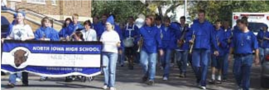
NIHS MARCHING BAND