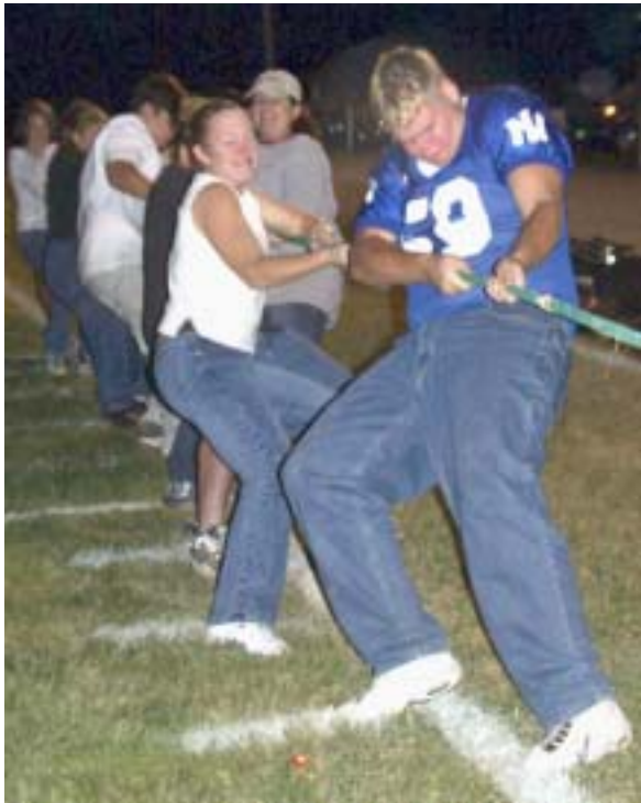
TUG OF WAR—SENIOR CLASS